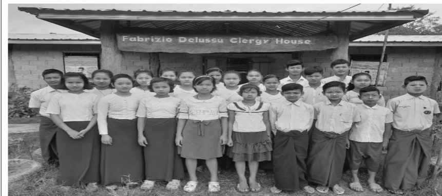
The children of Chaung Ma Gyi Mission Centre Myanmar

To donate, buy a bauble to decorate our Christmas trees for $5/each.